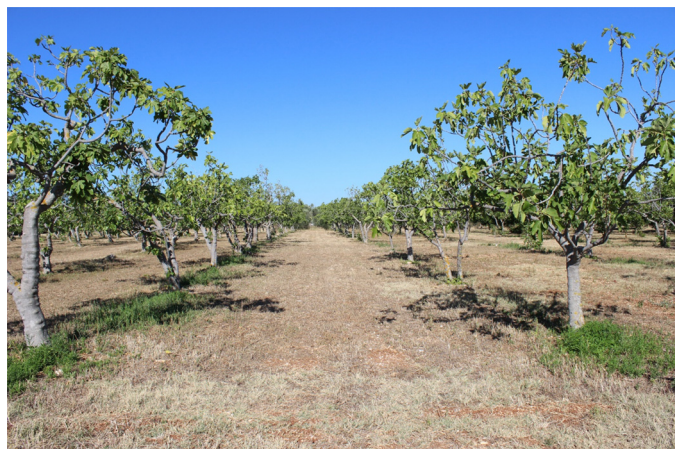
Fig. 2. Fig repository at the P. Martucci experimental station in Valenzano (Bari, Italy) in summer time.