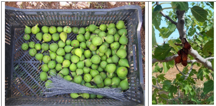
Fig. 1. Profichi to be prepared for the caprification trials (left) and at the end of caprification (right).